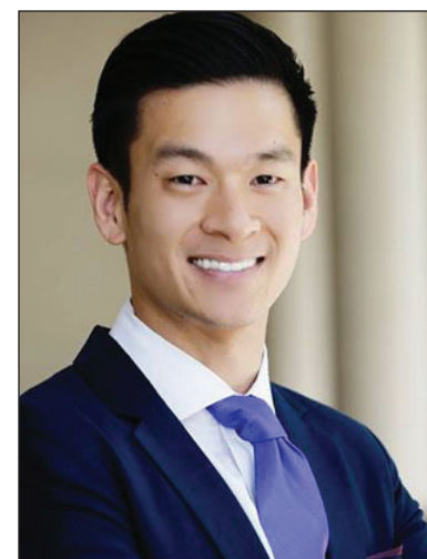
Assemblyman elect Evan Low

Low is working on is raising of awareness of public policy among young people.