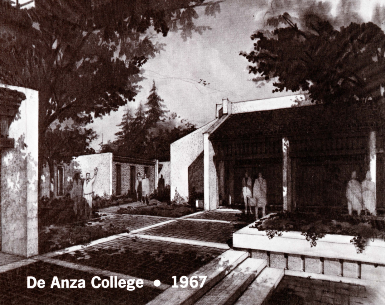
De Anza College • 1967