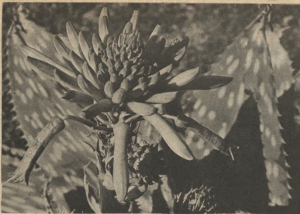
La Voz Photo by Galen Geer