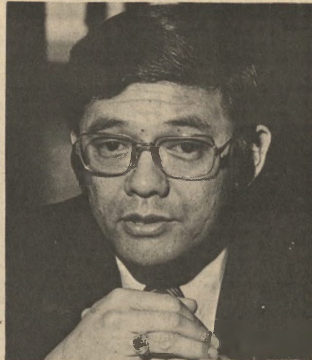
Rep. Norm Mineta — monies for Blood Alley.

"Congress is no longer looking toward the presidency for leadership," Mineta said. The new Congress has the momentum to make substantial changes and come up with alternatives to Ford's programs, he said.