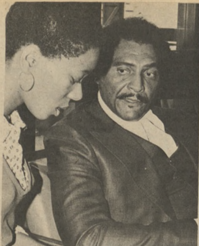
Actor William Marshall feels it is a shame for white actors such as Anthony Quinn to portray blacks.