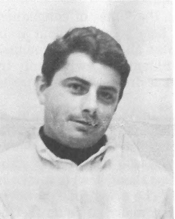
de la Barriere