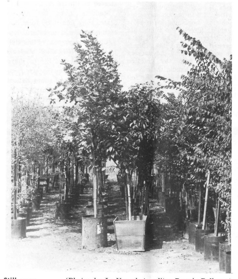
Still more . . . .

in the West Coast Nursery. A stand of 1500 redwood trees is included among these, according to Cutler.