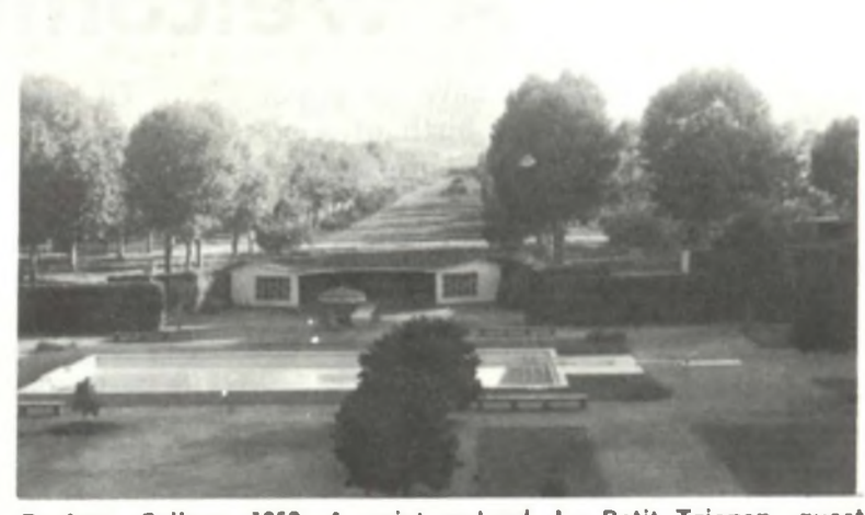
De Anza College, 1959. A quiet orchard, Le Petit Trianon, guest cottages, a swimming pool. Library is now located just in back of the swimming pool, which has been converted into a fountain.