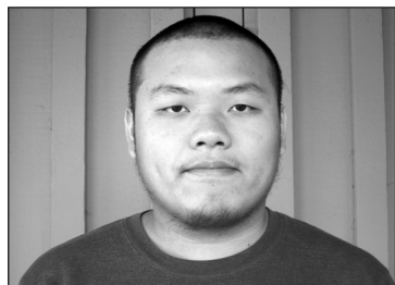
Jason Leung Staff Writer

New Students at De Anza College for the first time are likely to be freaking out at this point. You have tons of questions to be answered, but unsure of whom to ask. To be lost and clueless at a new school is only natural, but this guide might help give you an idea of what you should do or expect for your stay at De Anza College.