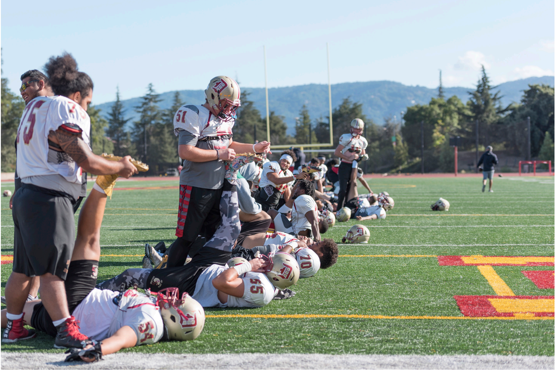
Above: De Anza football team members perform their intense daily training at De Anza College Sept. 21.