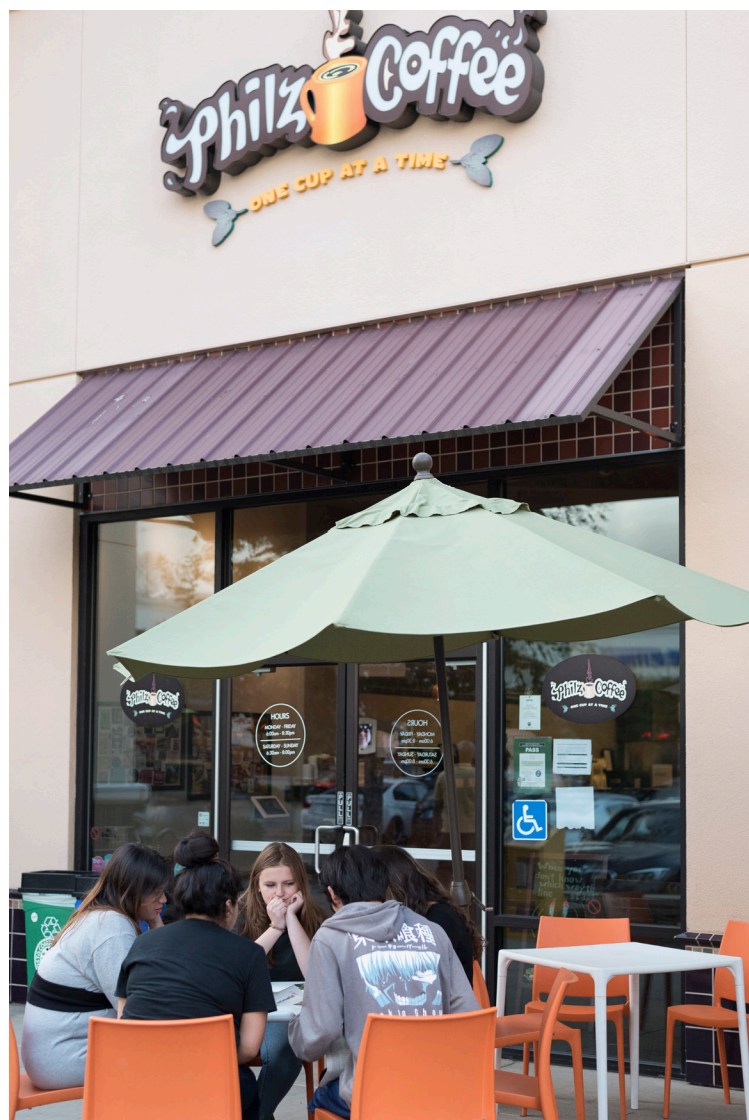
Above: Philz Coffee is at 20686 Stevens Creek Blvd, with cool outdoors seating.