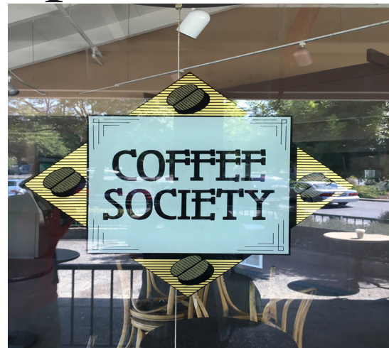
Left: Coffee Society in Cupertino closes after 30 years due to skyrocketing rents and new developments in the plaza.