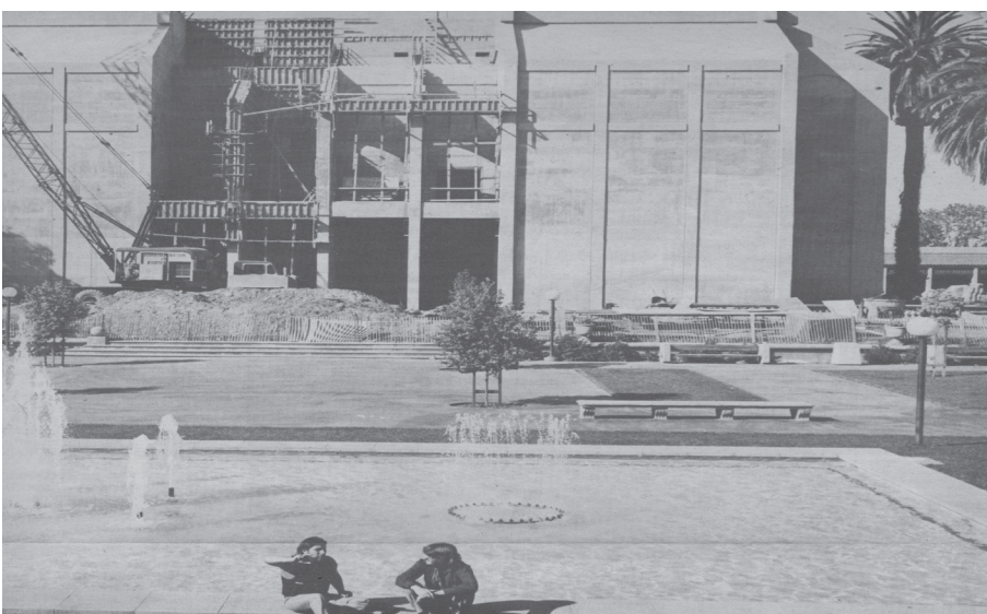
1970 - A new addition to De Anza College is this $5 million, 2,000-seat auditorium, is expected to be completed by mid-1971 and the first performance to be held next fall. (Sept. 21, 1970).