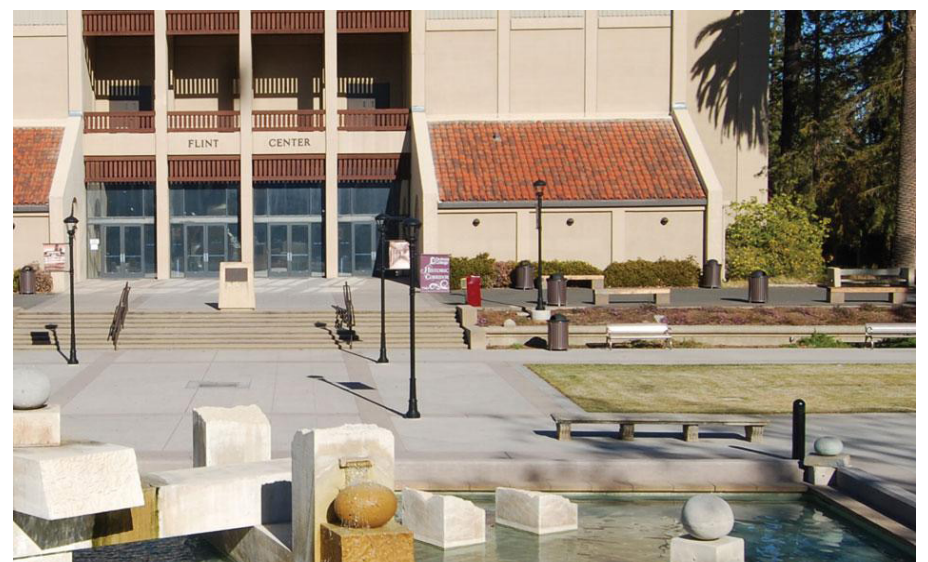
2015 - The future of the Flint Center is debated; the fountain in the Sunken Garden is filled with water.