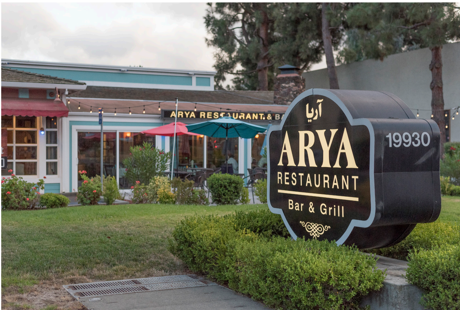
Above: Arya Restaurant serves Persian food at 19930 Stevens Creek Blvd