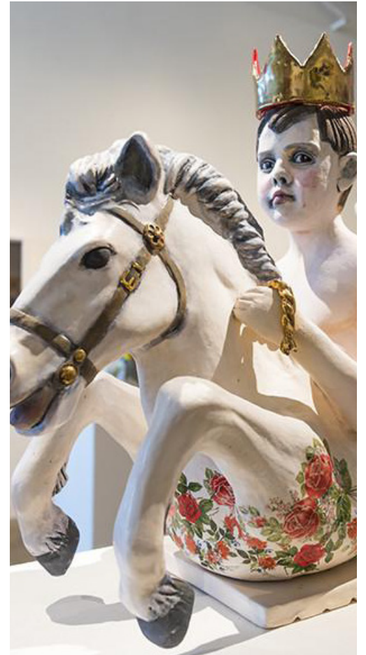
"My Direction" by Kimberly Cook is a slightly eerie yet remarkably beautiful ceramic sculpture on display at the Euphrat Museum (Oct. 15, 2016).