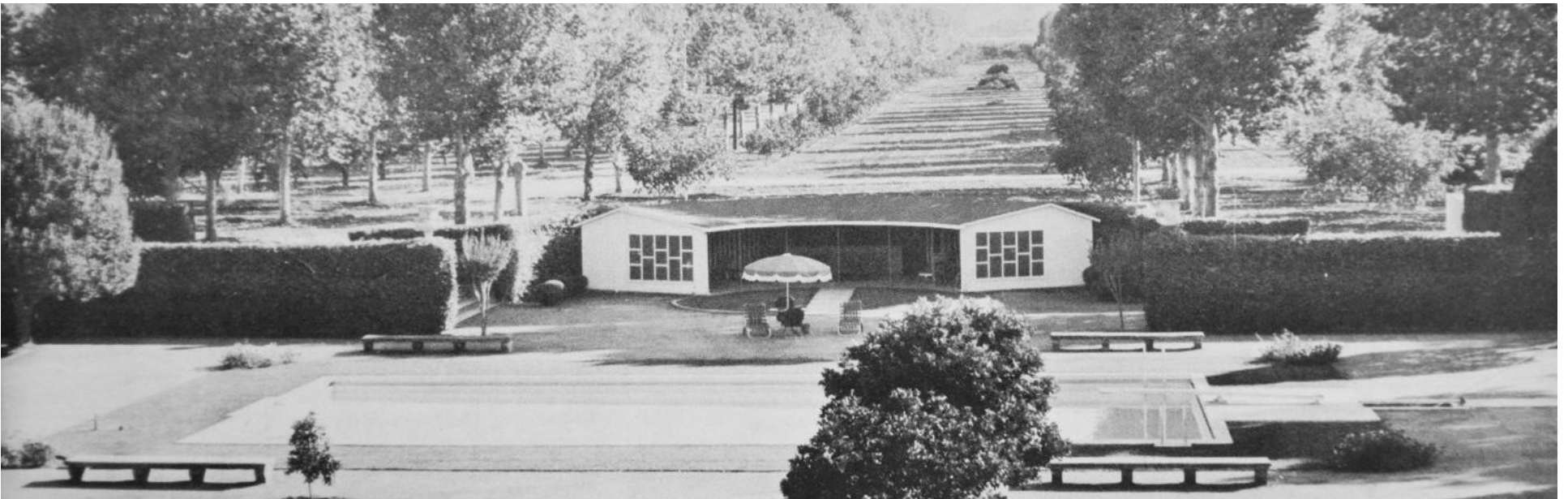
1959 - Site of the future De Anza College. A quiet orchard, Le Petit Trianon, guest cottages, a swimming pool. De Anza opens in 1967. Today's Sunken Garden and fountain have replaced the pool, and the library (which began construction in 1968) is where the pool house was.