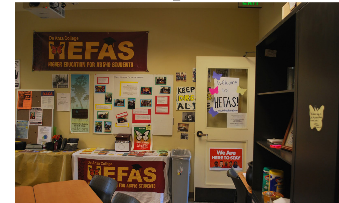
Above: HEFAS is now located at the East Cottage with VIDA.