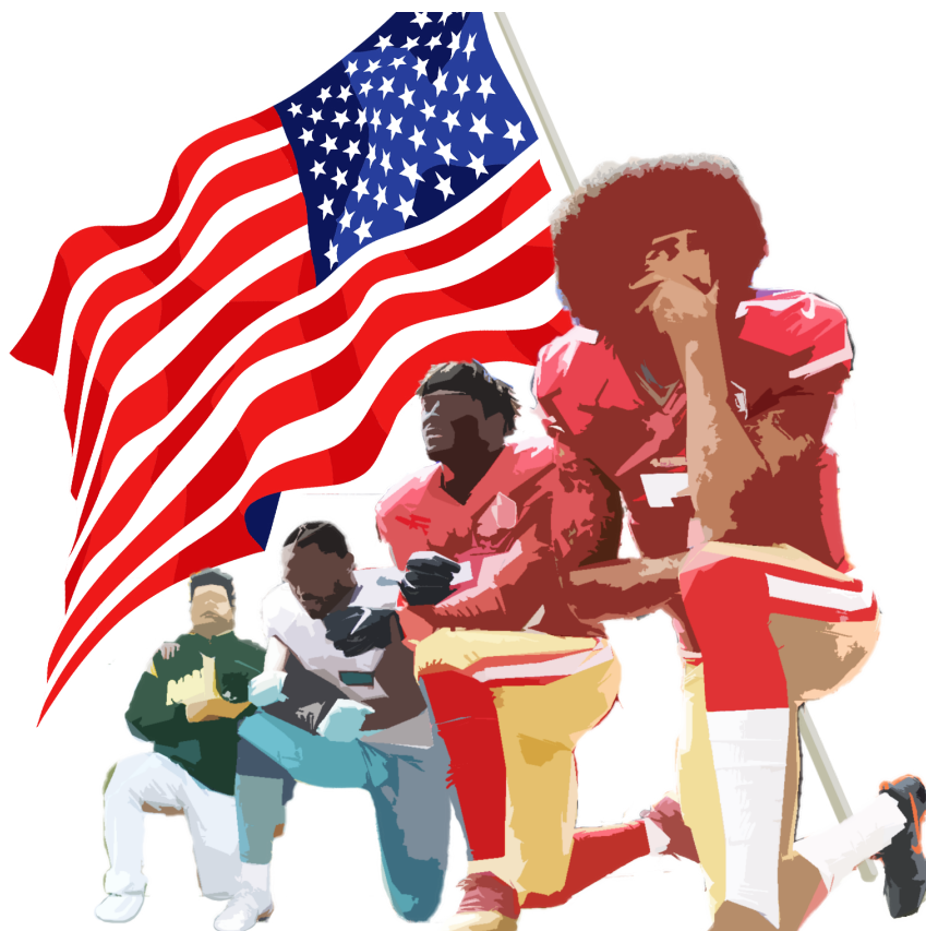
Graphic by Raphael Villagrancia

When Trump speaks to supporters he rambles and incites fear in half a country with lack of understanding, share the clarity of the Bay Area.