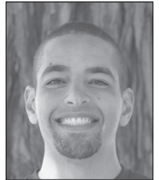
Russell Green STAFF WRITER

A new report by the Century Foundation, a progressive non-partisan think tank, warns that community colleges "are in great danger of becoming indelibly separate and unequal institutions in the higher-education landscape."