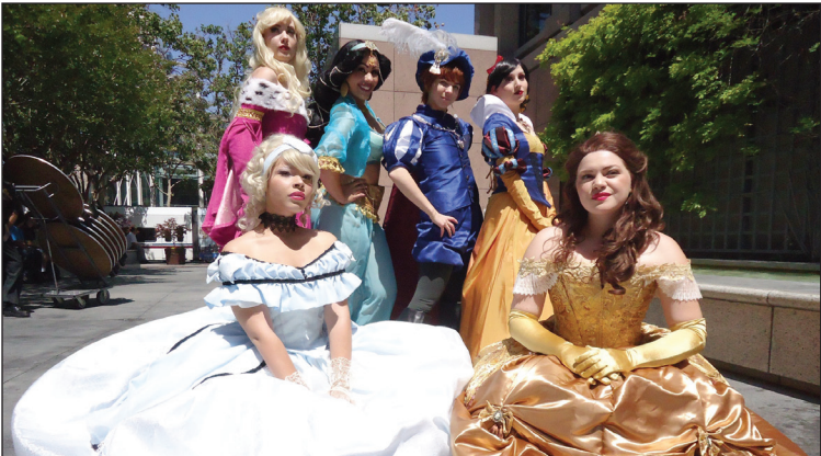
DISNEY ENCHANTMENT- Cinderella, Jasmine, Snow White, Belle, Aurora and a prince visit the FanimeCon at the McEnery Convention Center in San Jose, Saturday, May 25.