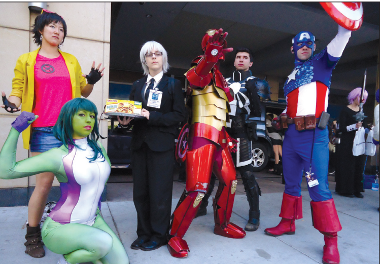
AVENGERS SAVE THE DAY - Marvel superheroes help a man in his suit sell waffles.